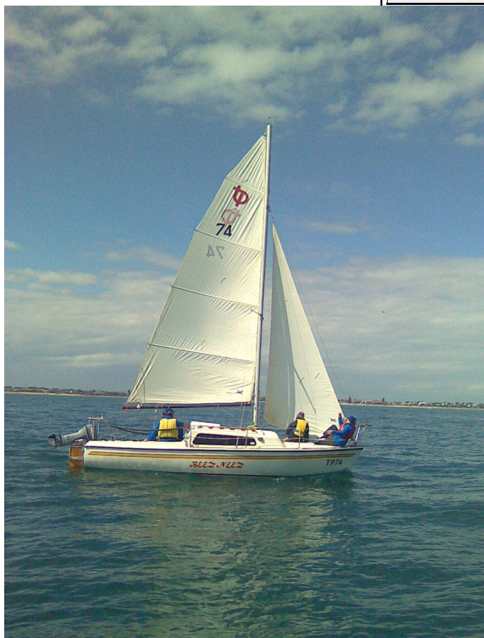
A relaxed crew enjoy light conditions

Watch the game on a big screen $5.00 cost