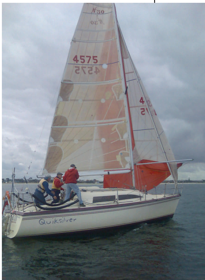
Mordialloc Motor Yacht Club boat Quiksilver tangling spinnaker in jib during winter race at Carrum

November 10th Trivia/Games night Fun and games for all Contact Wendy Lewis 0404-856-982