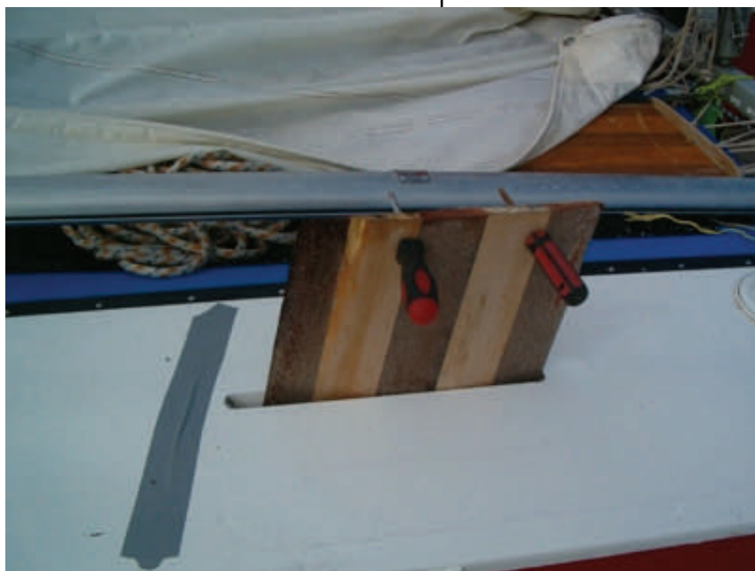
Why Friday night repairs occurred over winter. Cheetah two centreboard & hull as used at the end of last season