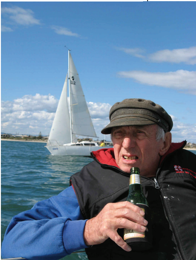
While in front the skipper relaxes with a cola.