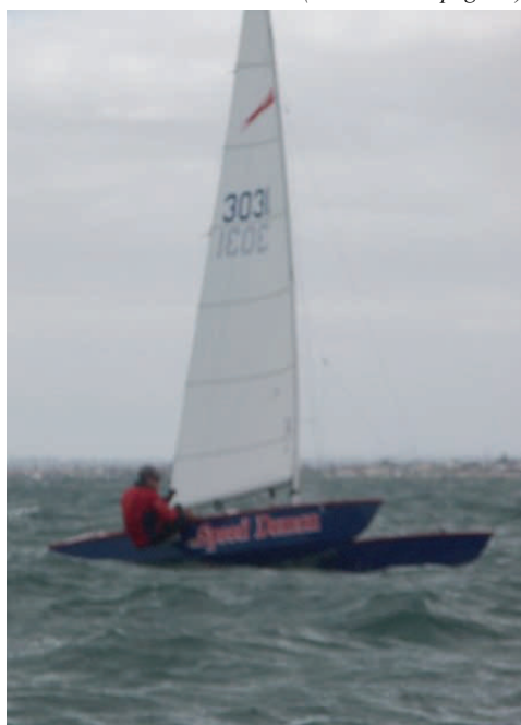
Paper Tiger "Speed Demon" racing in State Titles at Carrum SC