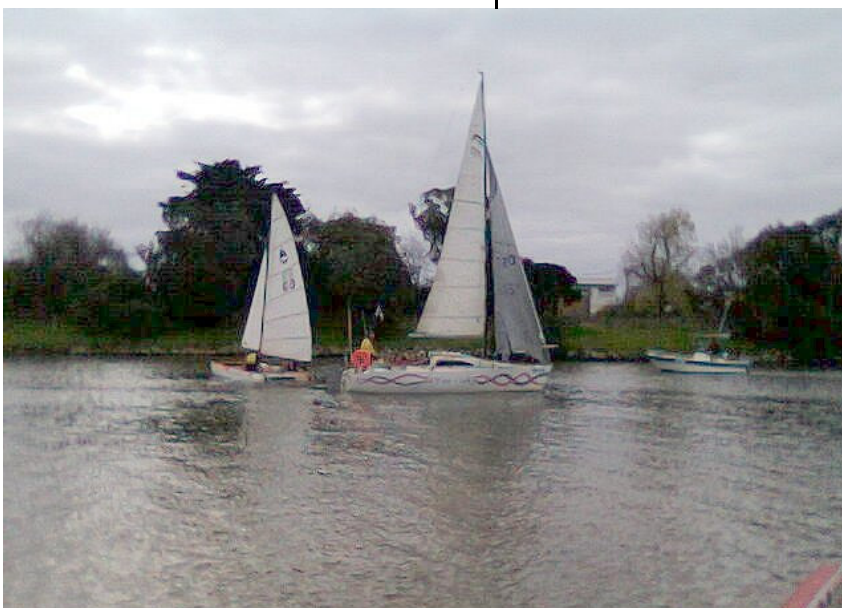
Dinghies and Trailerables were taking people out for rides on Patterson River during the Harvest Festival 13th May:

It is hoped that participating in this event will increase club membership.