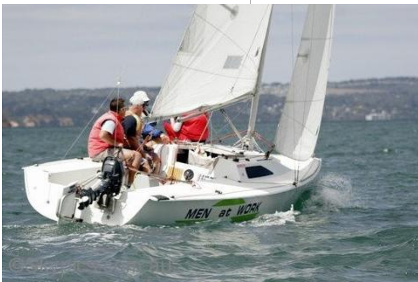
Men At Work Racing off Mornington