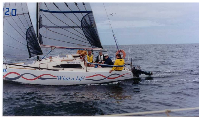
Learning to sail aboard MASRM 720 "What A Life"