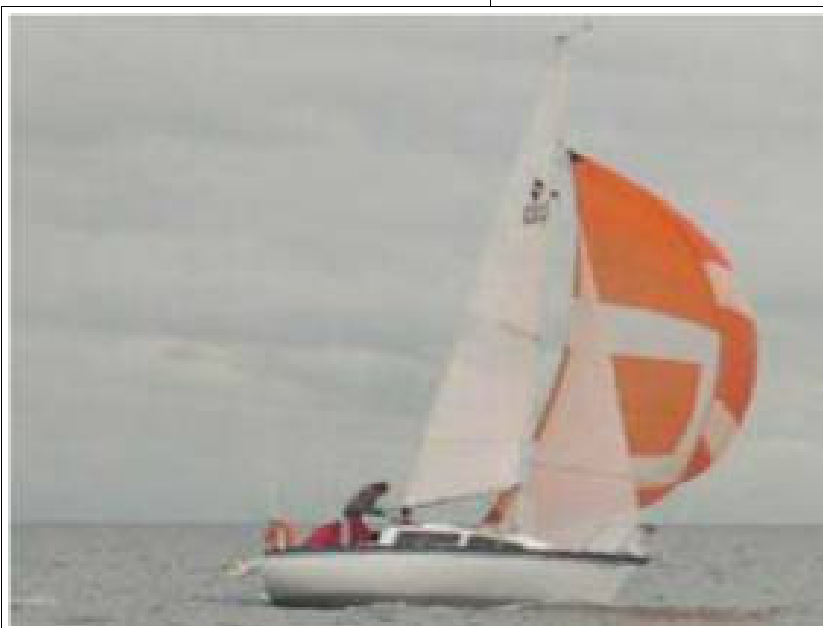
Captain Moonlite flying kite sideways June 19th 05.