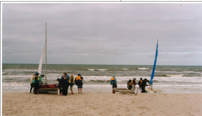
Some Learn to Sail students enjoyed heavier condition on Sunday March 6th