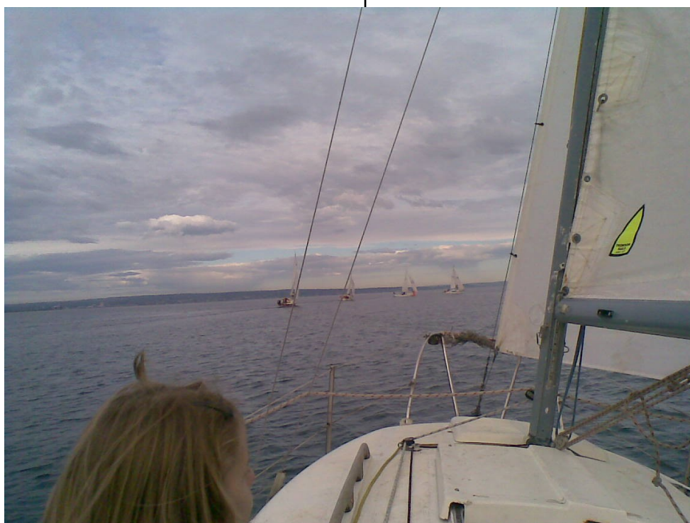
Get to work. The spinnaker is not yet ready for the windward rounding.

Clean up the club and get organised for start of the season next week