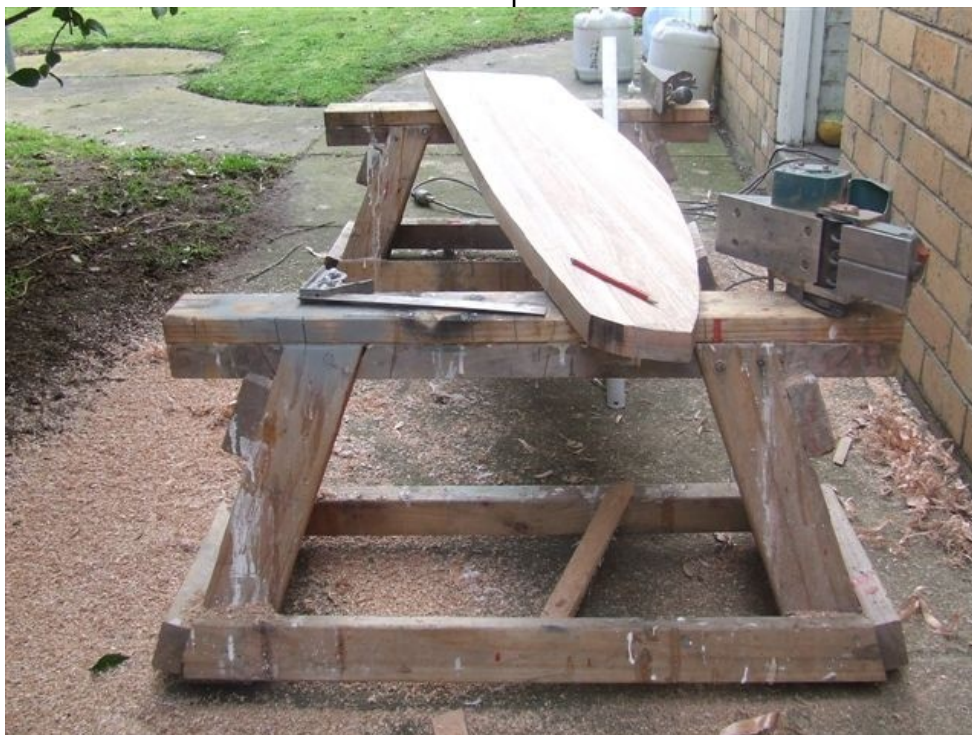
Eskimo's new rudder. Apparently square edges are the new go fast thing.