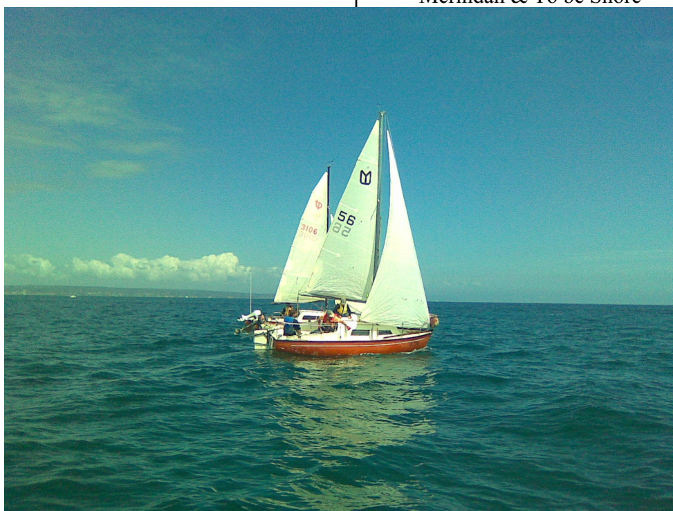
After a late start Timptation catches and passes Bitter sweet.