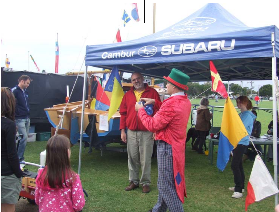
Some clown came up & asked "Are you selling Subaru's"