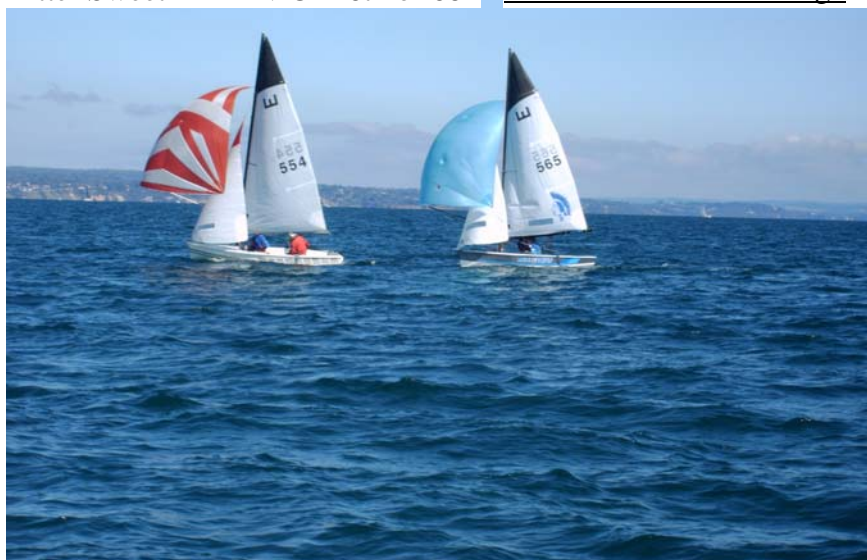
National E's return for their State Titles April 6th

Bushranger VI Div A 48th of 75 Capt. Moonlite Div A 52nd of 75 Eskimo Div C 8th of 68 Casper Div C 32nd of 68 Bitter Sweet Div C 46th of 68