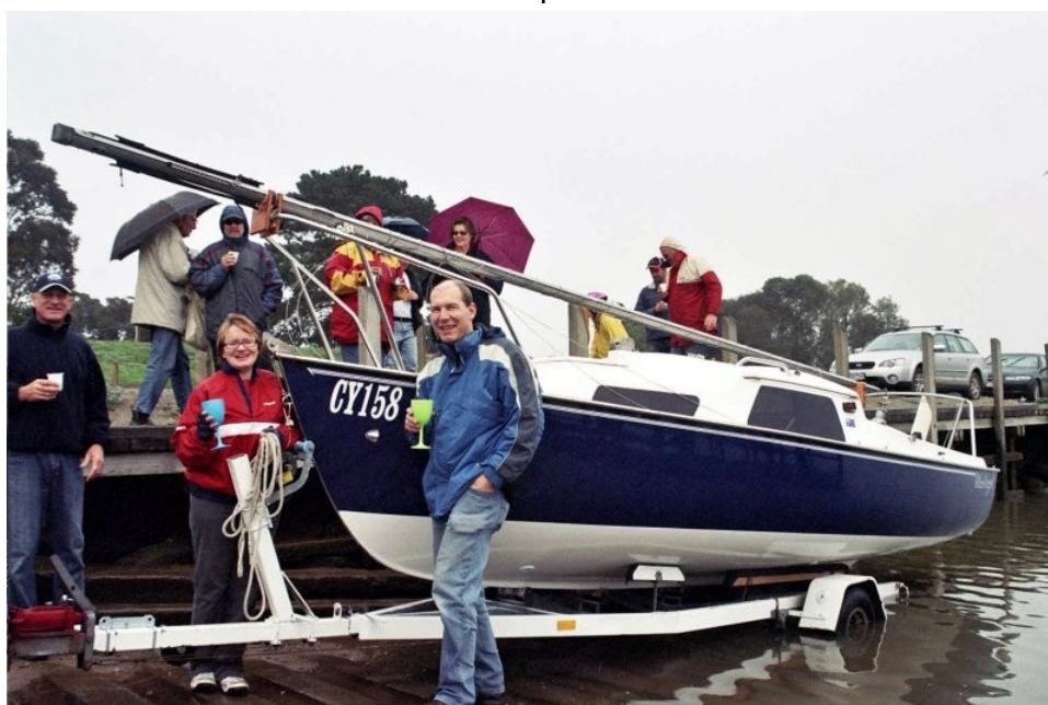
Any opportunity for a drink, even launching Blue Angel in the rain.