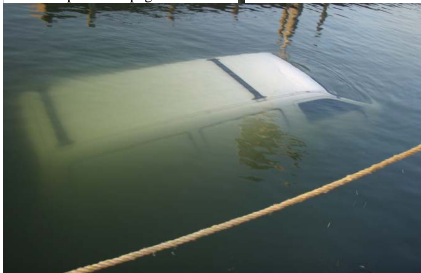
How not to launch a jetski - Patterson River April 6th