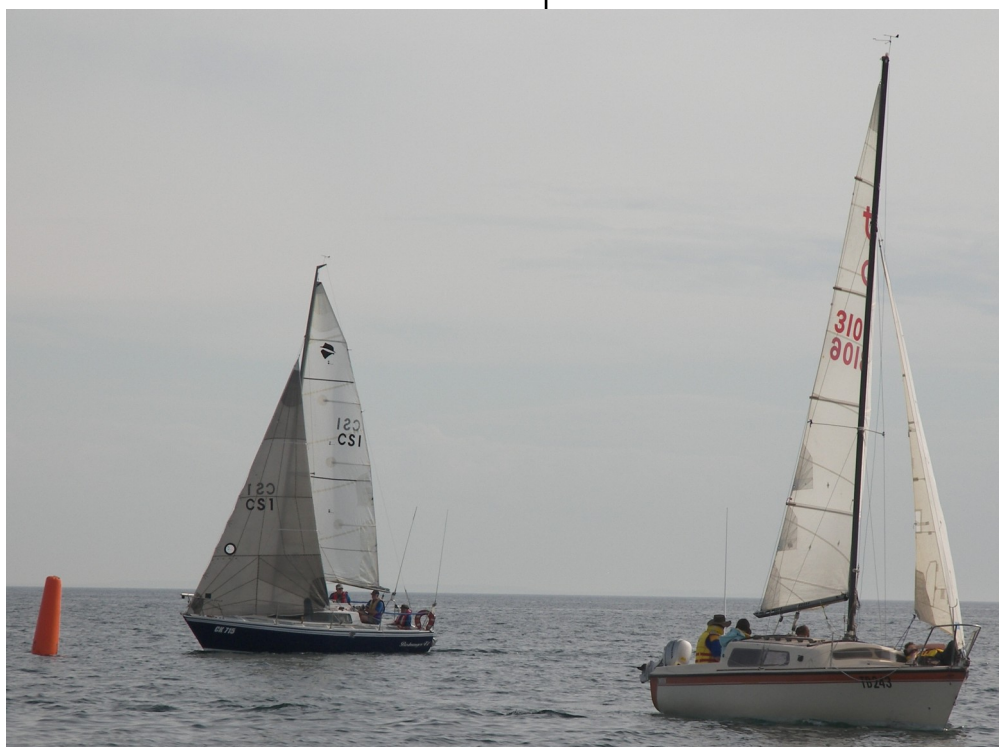
Timptation round the mark before Bushranger 18-04-10

July 11th Winter Sailing at MMYC Stern chaser CBH <.700 11:00 start CBH .700 –.750 @11:15