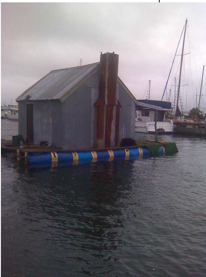
New Years entertainment was from the tin shed.