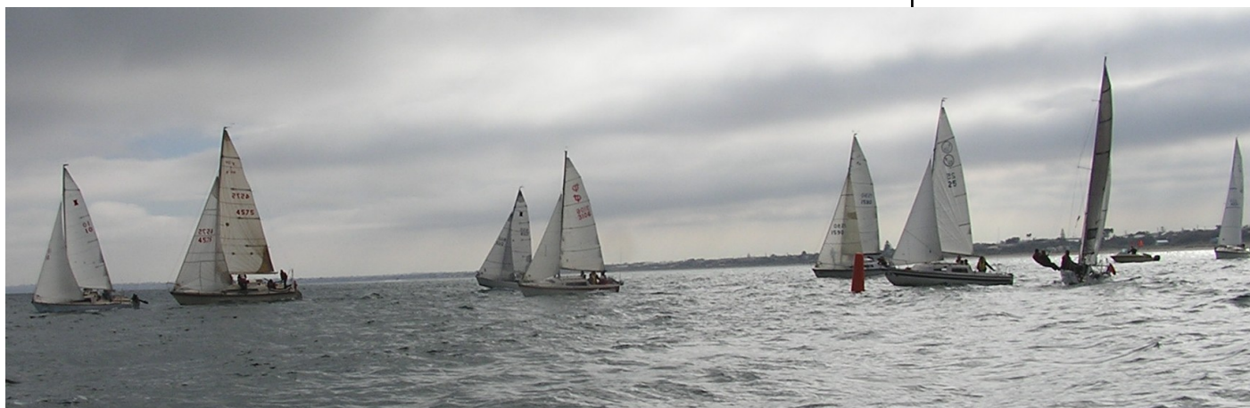
Timptation won the start on July 25th but was quickly overtaken by the quicker boats